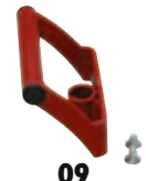
09 Handle JH 10 G plus ku