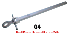
04 Pulling handle with towing eye