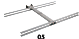
05 Extension tandem bar