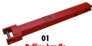
01 Pulling handle extension